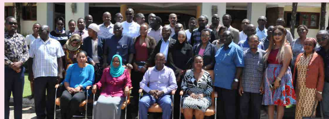
Editors drawn from several media outlets who attended one of the several meetings organised by the Media Council Tanzania pose in a group photo with Council officials.