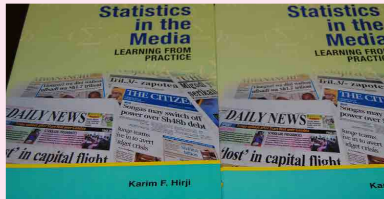
Copies of the book titled 'Statistics in the Media' authored by Prof. Karim Hirji which was published by the Media Council of Tanzania are displayed during the book's inauguration.