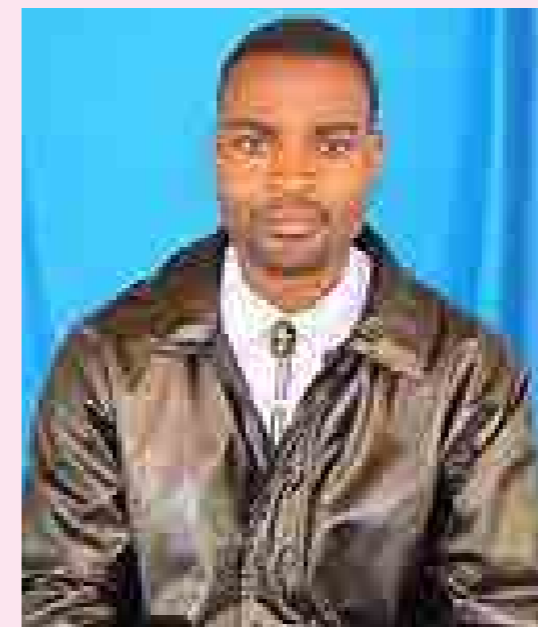
Slain journalist Daudi Mwangosi whose killing allegedly by Police was also investigated by a probe team set up by the Media Council of Tanzania.