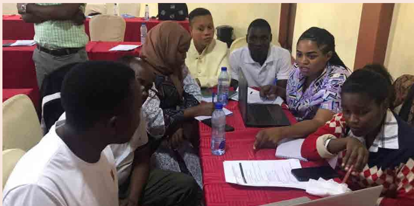
Participants of EJAT Master Class discuss in groups on how to have better TV stories. As part of their training, they played the roles of judges and went through five TV stories which were submitted during EJAT 2022.

This year a total 28 journalists benefitted from the master class, among them 17 were female and 11 males. The journalists were brought from TV, newspapers, radio and online. The training also covered Arusha, Dar es Salaam, Kagera, Iringa, Kilimanjaro, Dodoma, Lindi, Pemba, Shinyanga and Njombe.