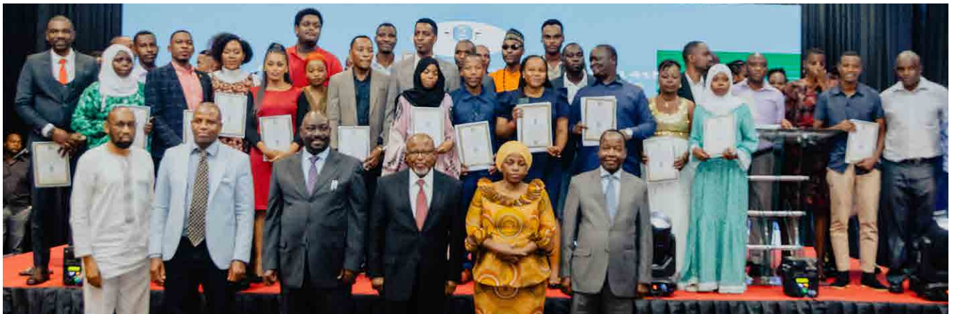
Winners of the Excellence in Journalism Awards Tanzania (EJAT) 2022 pose in a group photo.