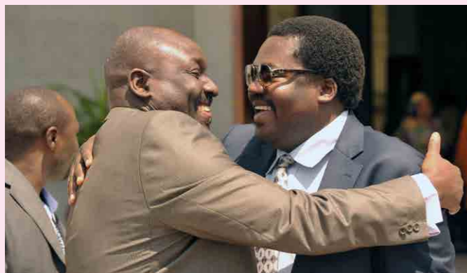
The Executive Secretary of the Media Council of Tanzania Kajubi Mukajanga embraces the then Minister for Information Emmanuel Nchimbi, at Parliament grounds in Dodoma.