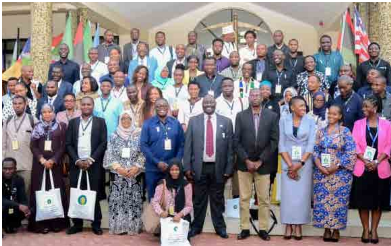
Delegates to the National General Convention (NGC) held in Arusha on September 28, 2023.