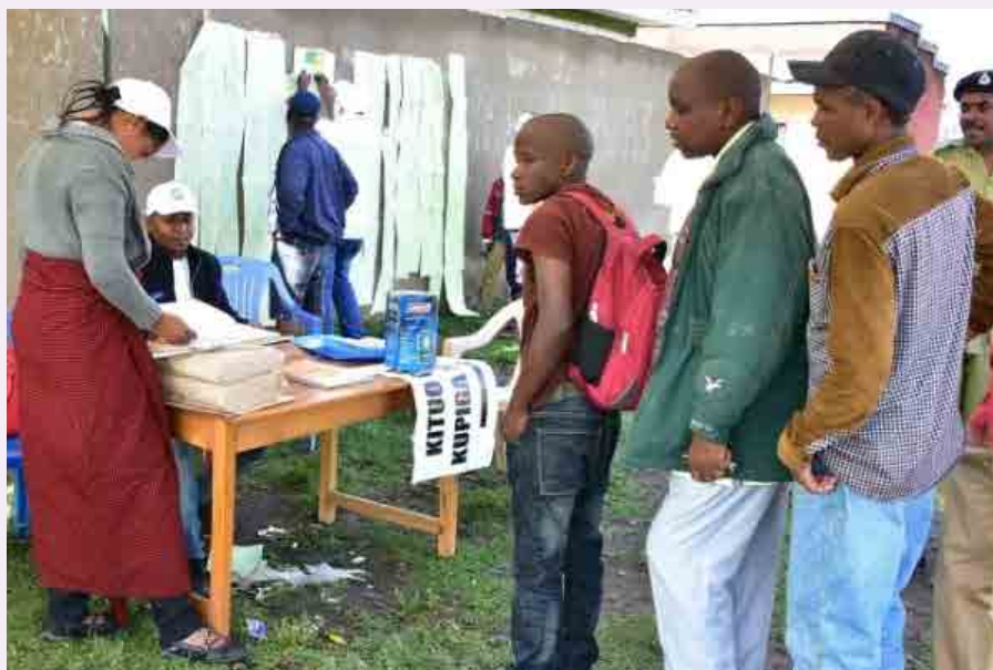
People queue to practice their constitutional right to participate in elections