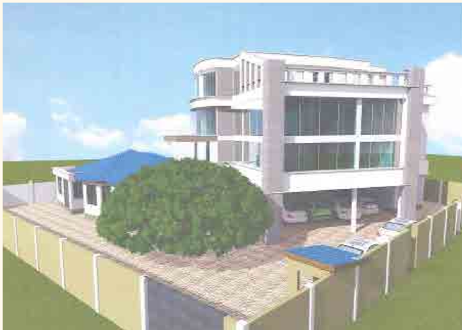
The architectural impression of the proposed new office building of the Media Council of Tanzania currently under construction.

A: I am happy that we have made inroads, but we need to keep pushing. Any gains attained can be undone, as was amply demonstrated during the late Magufuli administration. The most important achievement in this matter is, in my opinion, the establishment of a functional self-regulatory system. We need to guard these gains jealously, as there will always be attempts to derail us. The self-regulatory system itself will be under