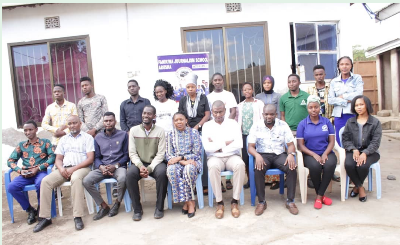
MCT delegation in a group photo with staff and some students of Fanikiwa Journalism Schools shortly after a DEFIR conference at the college premises located at Kwamorombo, Arusha.