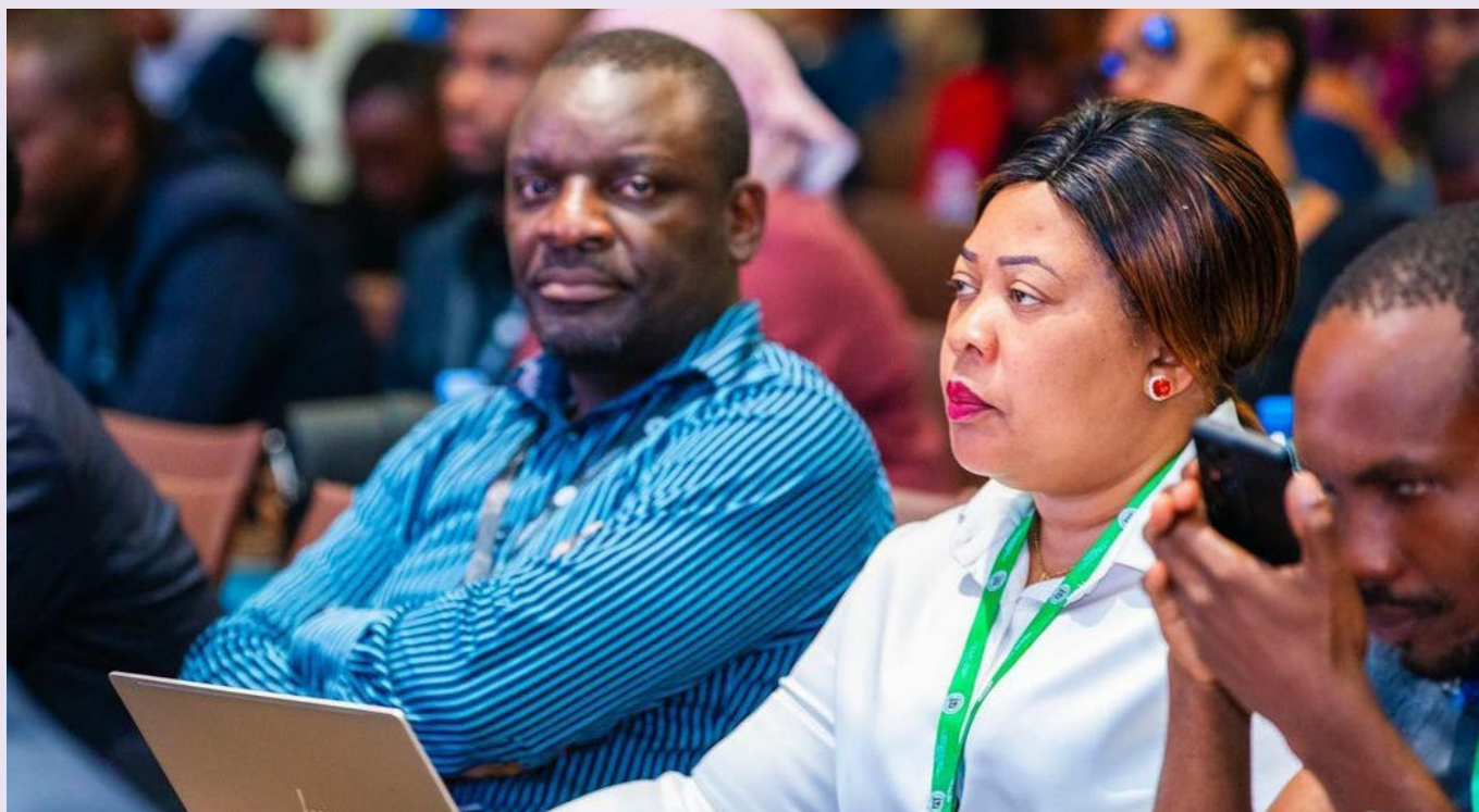
Participants of the Second National Symposium for the Media Sector held in Dar es Salaam