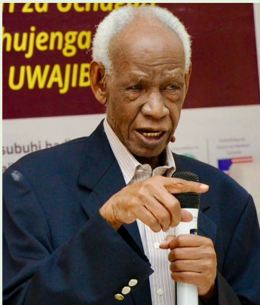
The former Prime Minister and First Vice President Joseph Sinde Warioba speaks during the Stakeholders' Symposium on the Role of the Media in Ensuring Credible Elections held on April 30, 2024 in Dodoma.

Speaking earlier, the Executive Secretary of MCT, Ernest Sungura, said the Council has prepared a national plan to facilitate media to play their role