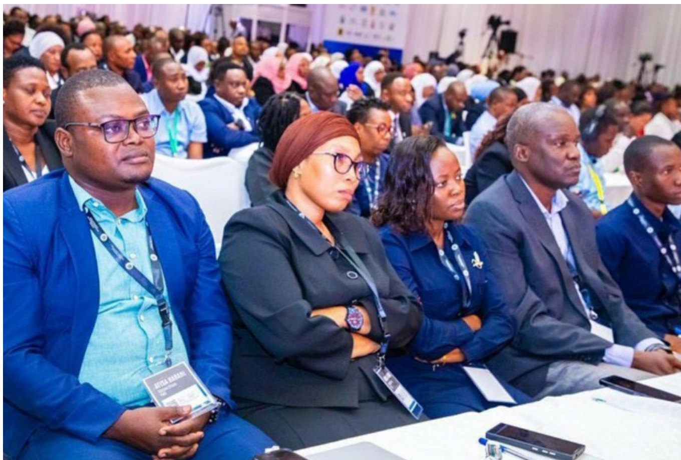
Participants attentively follow events during the Second National Media Sector Development Symposium held at Mlimani City Halli n Dar es Salaam.

Additionally, the conference also explored the opportunities and challenges of artificial intelligence in the media, legal frameworks on the safety of journalists, the UN Plan of action on the Safety of Journalists, and communication for national development.