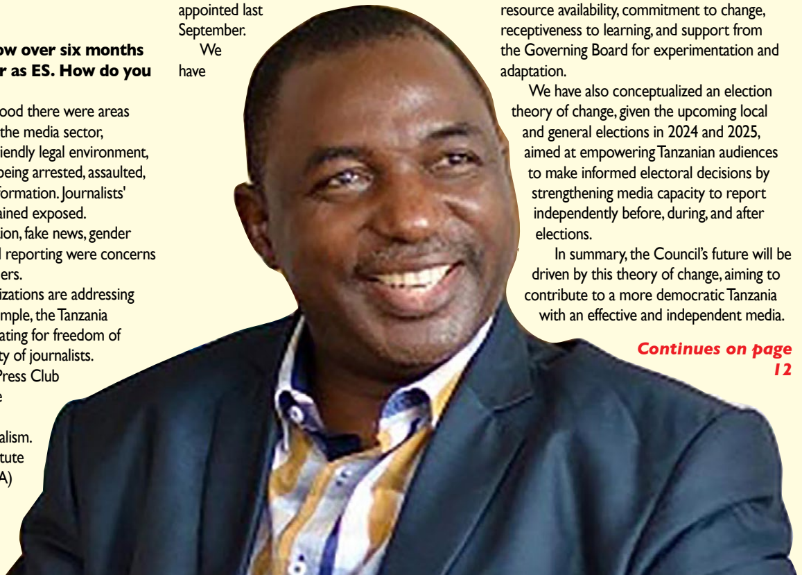
Ernest Sungura, the Executive Secretary of the Media Council Tanzania.