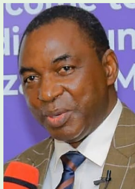
Ernest Sungura, the Executive Secretary of the Media Council of Tanzania (MCT)