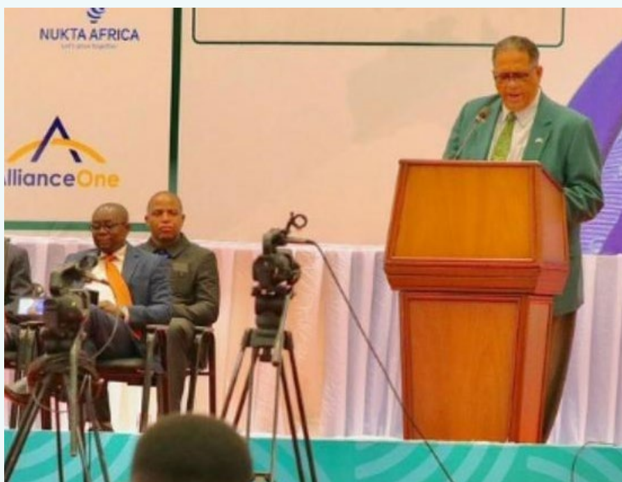
The US Ambassador to Tanzania, Michael Battle, speaks during the commemorations of the World Press Freedom Day in Dodoma.