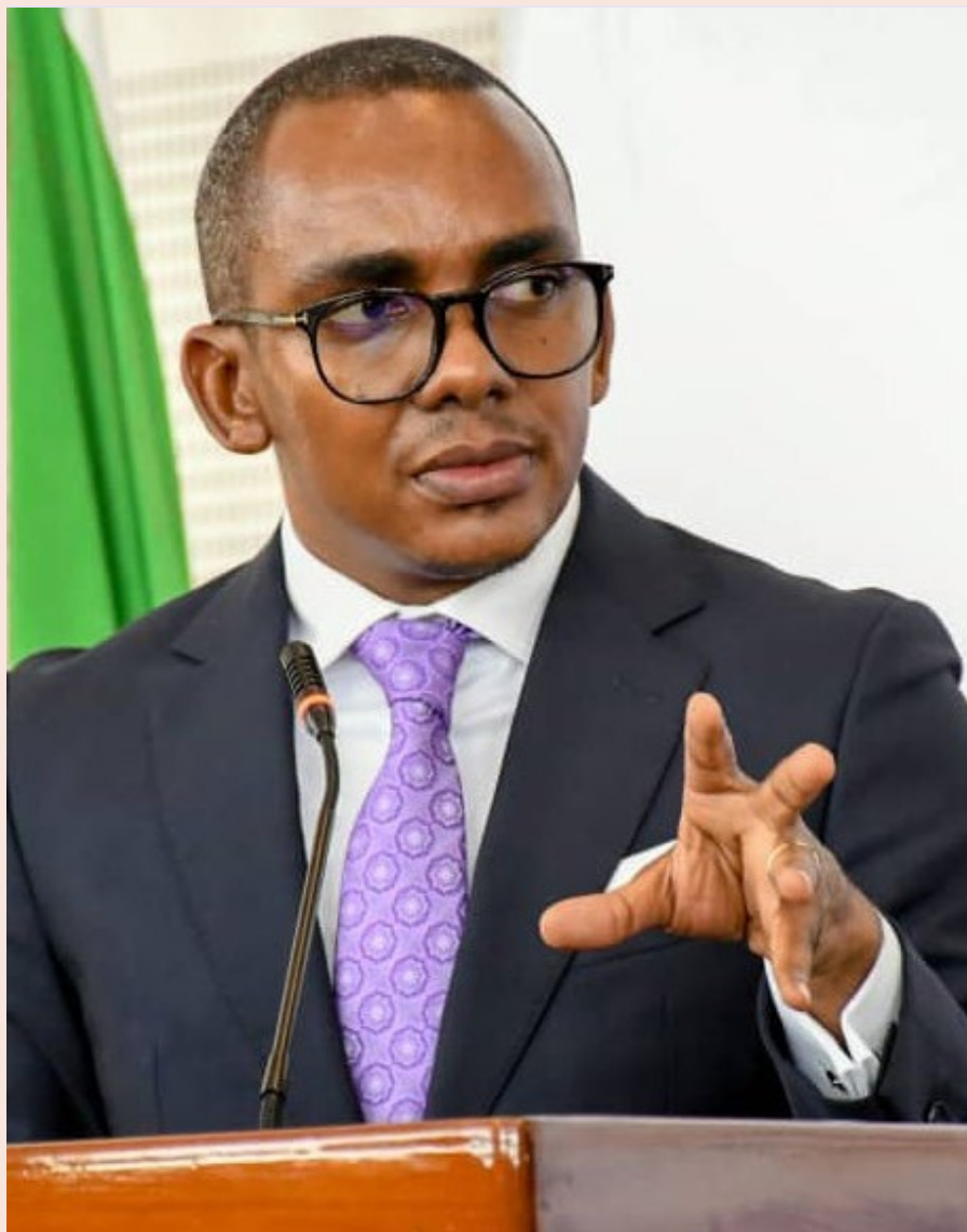
Jerry Silaa, the new Minister for Information, Communication, and Information Technology.

Nnauye was instrumental in the tabling and enactment of the Media Services Act of 2016 which was an historical achievement for the media to have a specifically tailored law for the sector. However the new law was