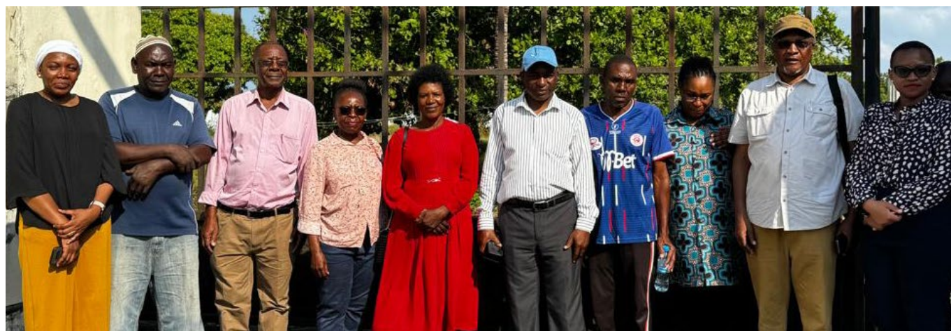
Some members of the Governing Board of the Media Council of Tanzania and staff of the Council pose in a group photo at Kimalang'ombe during a recent visit.

In a rapidly evolving digital environment, the media regulatory bodies highlighted the need for guidance on how media should navigate ethical issues related to the emergence of artificial intelligence (AI), convergence, and the need for innovative journalism curricula and training models.